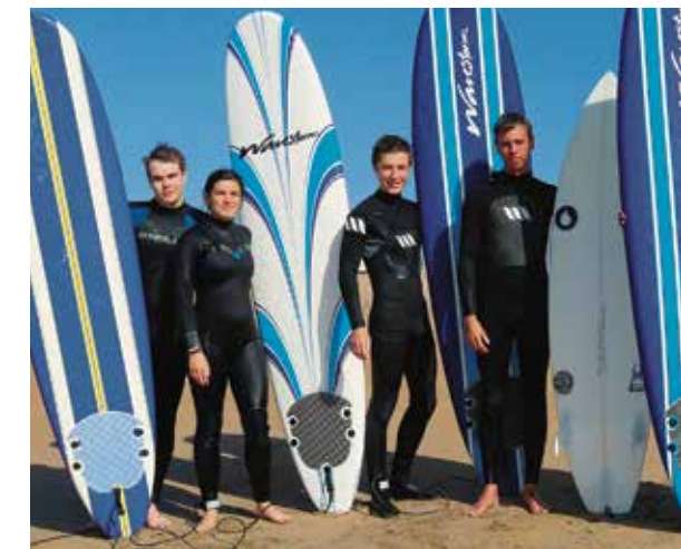
Students surfing at a local beach