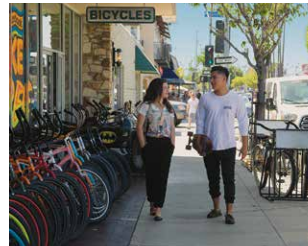
Students in Belmont Shore, a popular dining and shopping area

Apply today at cpie.csulb.edu/StudyAbroadAtTheBeach