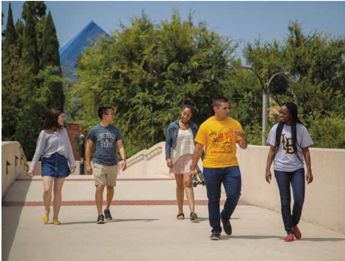
Students near the CSULB Pyramid